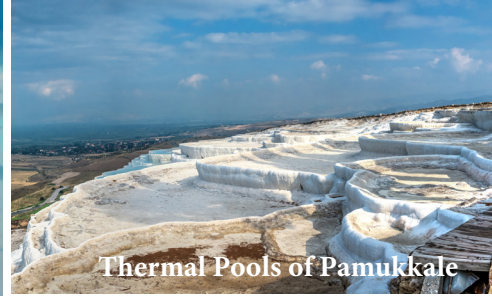
Thermal Pools of Pamukkale