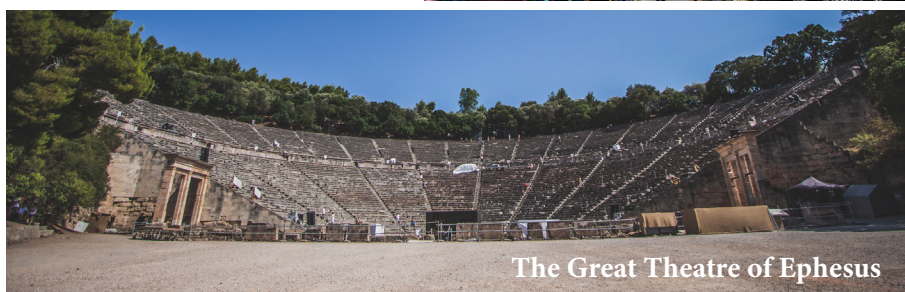
The Great Theatre of Ephesus