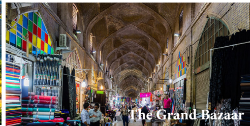
The Grand Bazaar